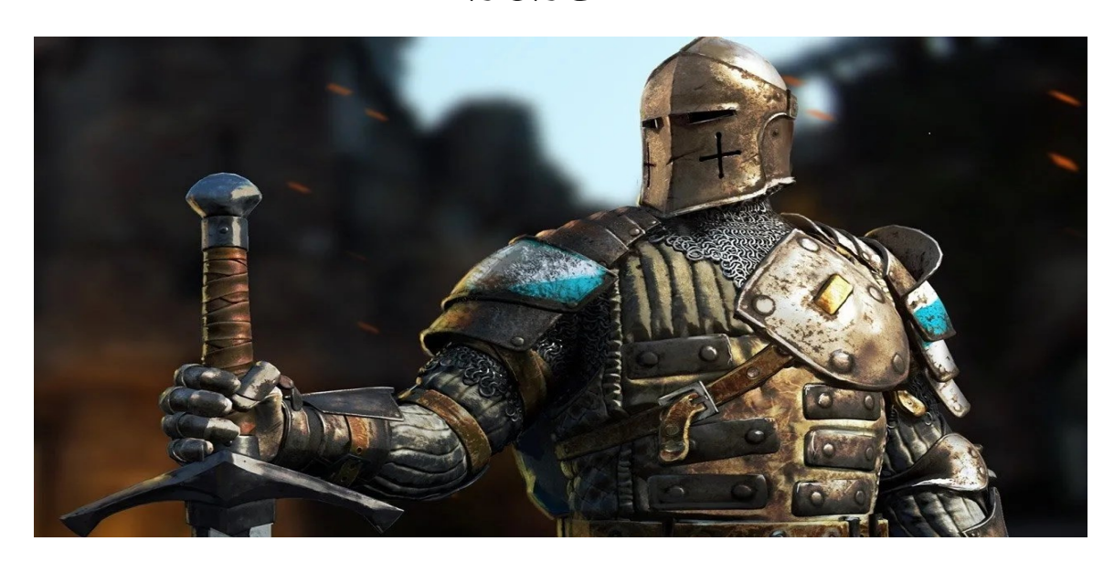
Put the armor of God on and be an Honorable Knight

Conformity: doing what everybody else is doing, regardless of what is right.